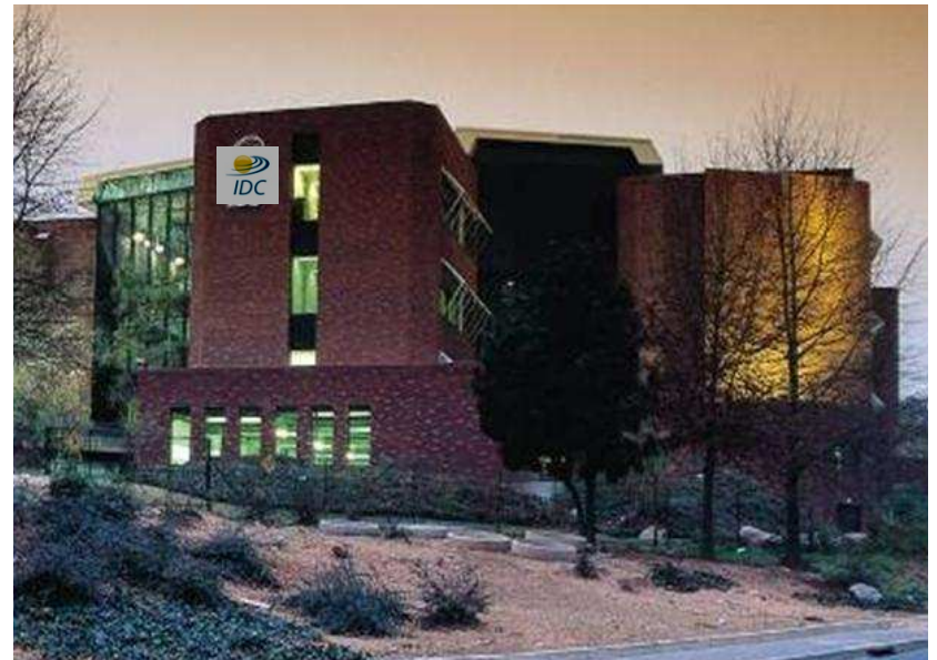
The IDC's Head Office in Sandton (Johannesburg), Cnr. Fredman Drive and West Street